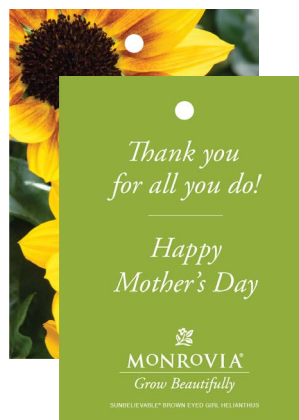
Free gift tags

NEW! Your participation qualifies you to join our FREE Social Gateway social media content service. Scan the code to activate your subscription.