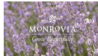
POCKET CARD FRONT 3.5" WIDE X 2" TALL ITEM NO: 60089CRD