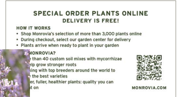
POCKET CARD BACK