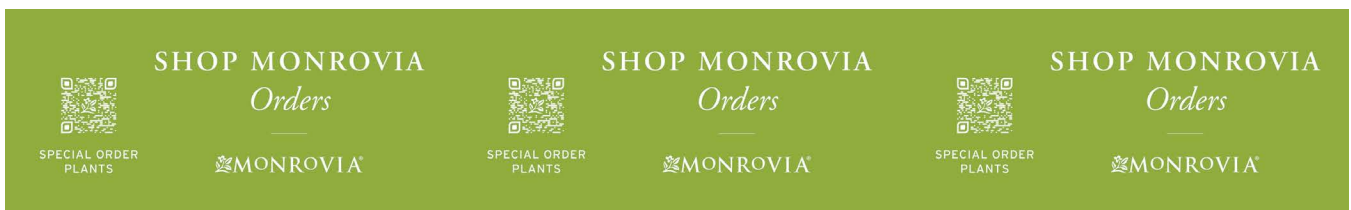
SHOP MONROVIA PICK UP TABLE WRAP 26' WIDE X 1' TALL ITEM NO: 60085BDM