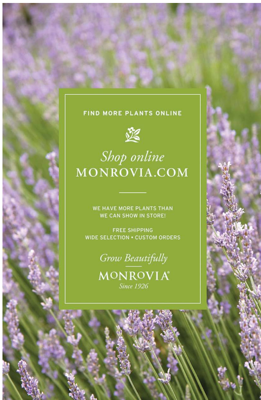
LAVENDER POSTER 23.5" WIDE X 36" TALL ITEM NO: 60040PST