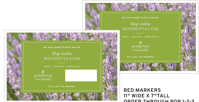
BED MARKERS 11" WIDE X 7" TALL ORDER THROUGH POP 1-2-3