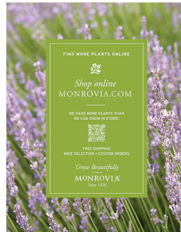
COUNTER CARD 8" WIDE X 10" TALL ITEM NO: 60088CRD