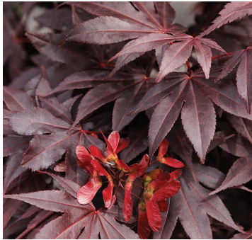
BLOODGOOD JAPANESE MAPLE Turning scarlet in fall, 15-20' x 15' #75 ZONES: 5-8