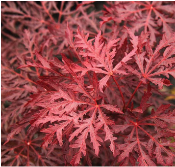
VELVET VIKING™ JAPANESE MAPLE Exceptionally cold tolerant, compact, 2-3' x 2-8' #03438 ZONES: 4-9

Growth habits are listed height by width