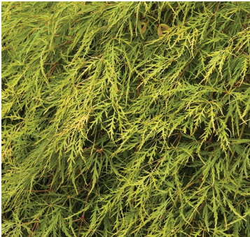
WATERFALL JAPANESE MAPLE Cascading, finely cut leaves, 8-10' x 10-12' #90 ZONES: 5-8