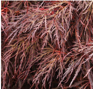
CRIMSON QUEEN JAPANESE MAPLE Low, weeping dwarf form, 10' x 10' #95 ZONES: 5-8