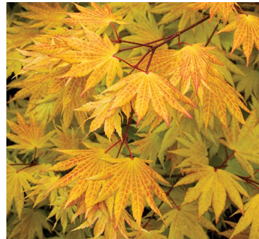
AUTUMN MOON FULLMOON MAPLE Similar species; colorful foliage, 8-12' x 6-8' #03033 ZONES: 5-7