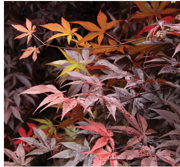
EMPEROR I® JAPANESE MAPLE Fits smaller landscapes, 15' x 15' #84 ZONES: 5-8