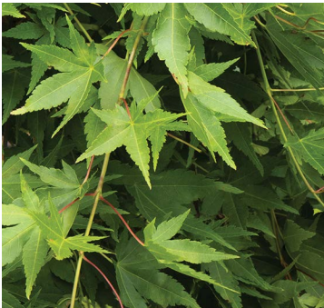
RYUSEN WEEPING JAPANESE MAPLE Narrow upright weeper, 20' x 5-6' #40044 ZONES: 5-7