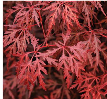
ORANGEOLA JAPANESE MAPLE Kaleidoscope of colors, 4-8' x 3' #2908 ZONES: 5-8