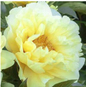
YUMI™ (BEAUTY) ITOH PEONY ZONES: 4-8