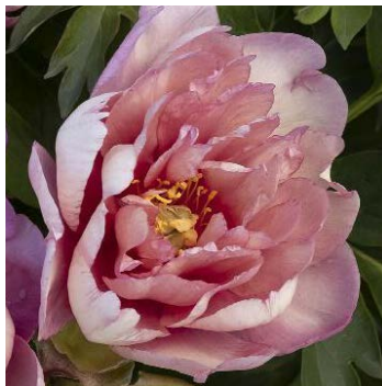
KEIKO™ (ADORED) ITOH PEONY ZONES: 4-8