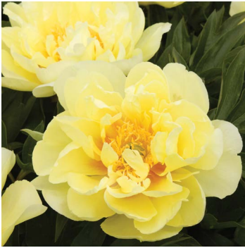
BARTZELLA ITOH PEONY ZONES: 4-9

Flowers are held upright on top of the bush and do not require support.