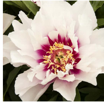
CORA LOUISE ITOH PEONY ZONES: 4-8