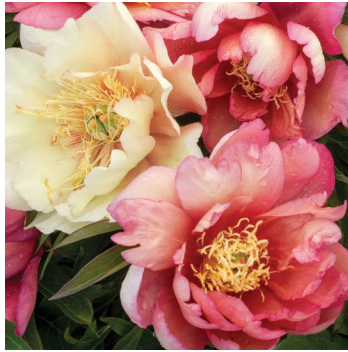
JULIA ROSE ITOH PEONY ZONES: 4-9