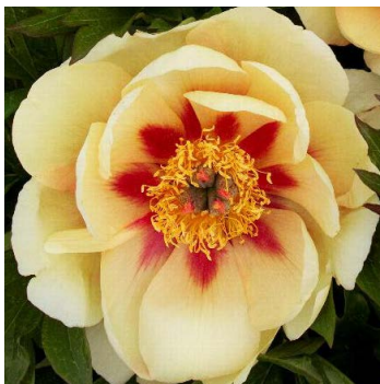
MISAKA™ (BEAUTIFUL BLOSSOM) ITOH PEONY ZONES: 4-8