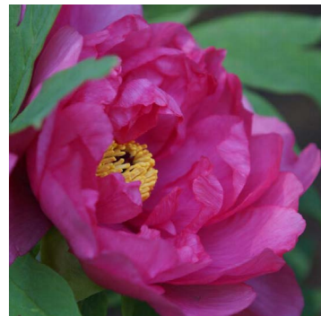
PINK ARDOUR ITOH PEONY ZONES: 4-8