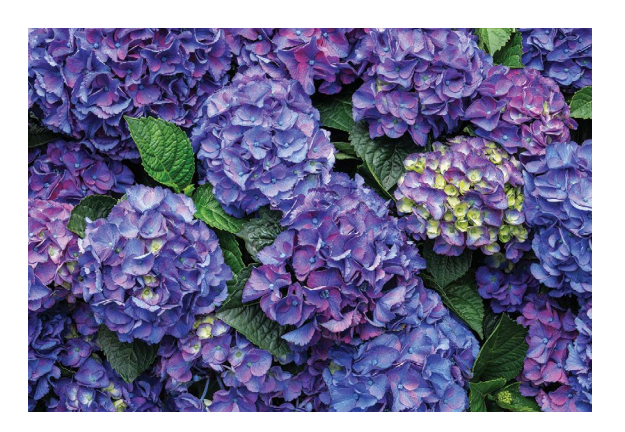
SEASIDE SERENADE® NEWPORT HYDRANGEA

Available while supplies last and Social Gateway membership seats are available. First come, first-served.