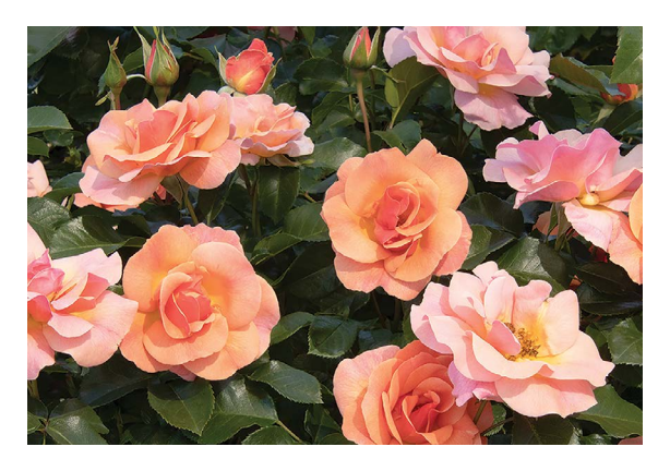
NITTY GRITTY® PEACH ROSE